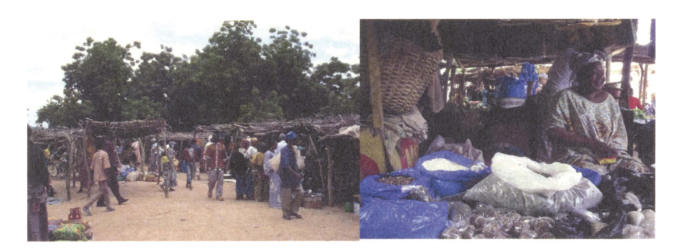
Local market (left) and petty trader (right) of baobab and tamarind products in Mali.

Gatherers of baobab and tamarind products are categorised as smallholders. After harvesting, they transform fresh baobab leaves into dry baobab leaves and/or baobab leaf powder, baobab fruits are processed into baobab fruit pulp, tamarind leaves are dried, and tamarind fruit pods are stripped from their shell. In the present study, the portion of cash income obtained from baobab and tamarind products is about 4% for the poorest and 5% for the richer households in Mali, whereas, in Benin, a contribution of up to 11% is reported for the poorest group of smallholders. These figures show that baobab and tamarind products fall into the gap-filling income category. The majority of surveyed gatherers in Mali and Benin reported to sell their baobab and tamarind products at the farmgate. Baobab and tamarind fruits and leaves are harvested using traditional harvesting techniques, which only require manual labour and low-cost tools. Leaf harvesting practices, in the case of baobab, may negatively impact on fruit production, Therefore, in general, sustainable harvesting practices need to be developed and proposed to promote the species' conservation and avoid overexploitation. Surveyed gatherers in Mali and Benin mentioned dangerous harvesting techniques, seasonality and limited availability of baobab and tamarind products, time-consuming processing practices, product quality and a lack of market information as their major problems.