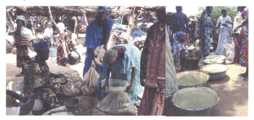
Baobab leaf powder is sold ungraded.

Harvesting of baobab and tamarind fruits, and baobab leaves is highly seasonal. This is further reflected in the commercialisation of baobab and tamarind products which is found to occur chiefly during the dry season in Benin. In Mali, marketing of baobab and tamarind products is observed to be less seasonal. However, no seasonal storage has been evidenced in Mali and Benin due to a lack of storage infrastructure, space and financial means. Most surveyed chain actors typically purchase a certain volume of produce, which is stored until it is sold, after which they replenish their stock. As a result, storage duration is observed to be very variable. In the present study, dry baobab and tamarind products are mainly stored in recycled rice bags which are kept in the house or in a storehouse or granary, in respectively Benin and Mali. Even though humidity and bug, mice and fungi attacks were reported as main problems during storage, the informants rated overall storage conditions as good.