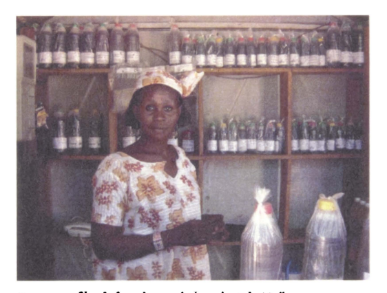
Processor of baobab and tamarind products in Mali.

Processors in Benin reported to make juice from baobab and tamarind fruit pulp, whereas in Mali, processors use baobab and tamarind fruits in the preparation of juice, syrup, jam and instant juice powder. Additionally, baobab fruit pulp is used in Mali for mixing with millet flour to prepare millet cream (locally called dégué). Processing is generally not reported as a one-man's business and processing (family) enterprises were found to transform a whole range of different products. Notwithstanding manual processing techniques and simplicity of equipment used, the portion of efficient processors identified by means of a data envelopment analysis is 63% in Mali and 49% in Benin. Thus, processors appear to be efficient under the given circumstances in Mali and Benin. The major cost that processors in both countries face is the cost of packaging material. Moreover, surveyed processors in Mali and Benin reported inappropriate and expensive packaging material, limited availability of adequate processing equipment, bad transport due to poor road infrastructure, lack of financial means and limited market information as main constraints.