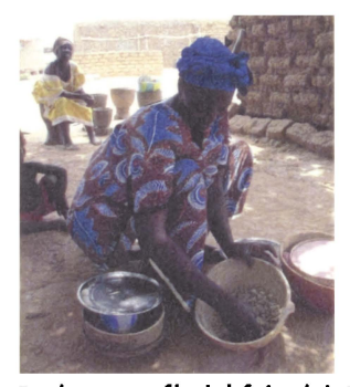
Rural consumer of baobab fruit pulp in Mali.

Processors in Benin reported to make juice from baobab and tamarind fruit pulp, whereas in Mali, processors use baobab and tamarind fruits in the preparation of juice, syrup, jam and instant juice powder. Additionally, baobab fruit pulp is used in Mali for mixing with millet flour to prepare millet cream (locally called dégué). Processing is generally not reported as a one-man's business and processing (family) enterprises were found to transform a whole range of different products. Notwithstanding manual processing techniques and simplicity of equipment used, the portion of efficient processors identified by means of a data envelopment analysis is 63% in Mali and 49% in Benin. Thus, processors appear to be efficient under the given circumstances in Mali and Benin. The major cost that processors in both countries face is the cost of packaging material. Moreover, surveyed processors in Mali and Benin reported inappropriate and expensive packaging material, limited availability of adequate processing equipment, bad transport due to poor road infrastructure, lack of financial means and limited market information as main constraints.