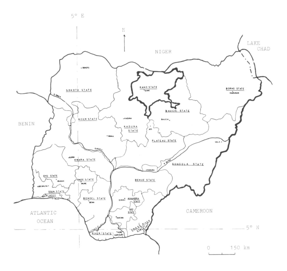
Figure 2: The 19 states of Nigeria