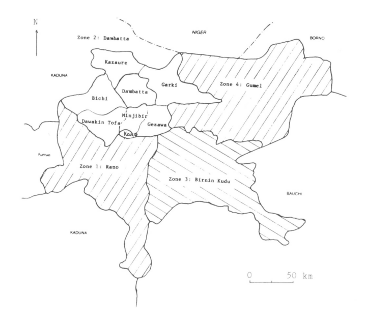
Figure 3: The 4 agro ecological zones of Kano State