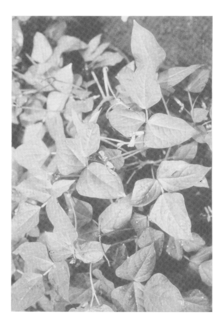
Cowpea plants with flowers and young pods