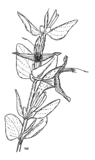
Figure 1: Ruellia diversifolia

The leaves and stems are cooked and eaten as vegetables. They can be fried with onions.