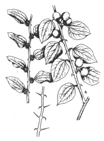
Figure 2: Ziziphus mucronata