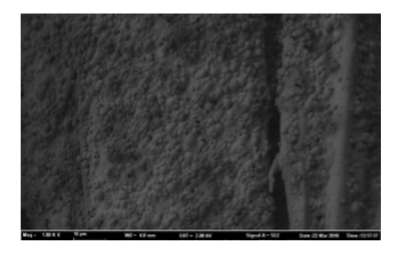
Figure 1. Microcapsules presence on the fabric.

Once the microcapsules were applied on the fabric, it was observed with the SEM. Figure 1 shows the presence of the microcapsules on the fabric, concisely it is the fabric with jute 220 g/m<sup>2</sup>. Figure 2a shows the original fabric with a region containing Microcapsules and a region where they were not applied. Figure 2b shows the thermochromic camera during the test. Table 1 shows the maximum temperature the fabric reaches after 135 seconds of heating.