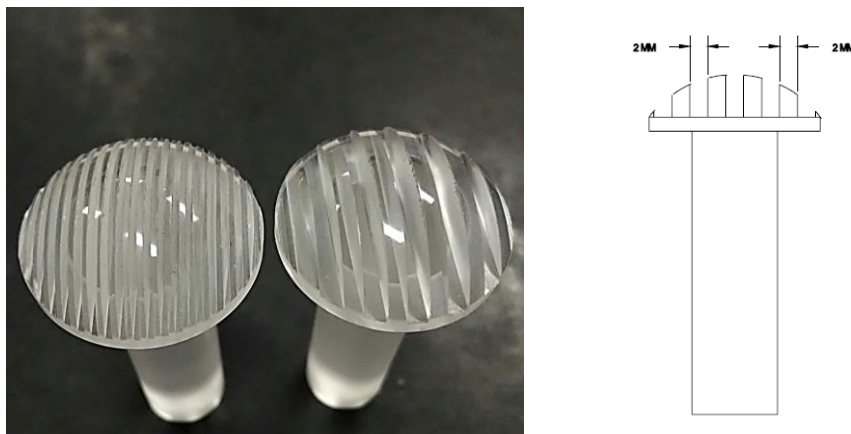
Figure 1. JVP Domes gratings

We divide the sample group in three smaller groups of assessors i.e. g_{75} \in (0.60, 1.00) the lowest range group G_L , g_{75} \in (1.01, 1.20) the middle range group G_M , and g_{75} \in (1.21, 1.50) the highest range group G_H , this in order to investigate the consistency of the results from the group of lower and higher sensitivity range. Six assessors are present in G_L , 11 are present in G_M and seven in G_H .