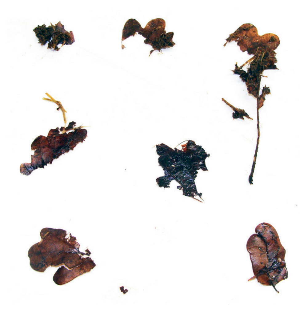
Figure 1. Incomplete oak leaves found in the forestomachs of the ewe during necropsy.

amount of oak leaves in the forestomachs, focal hemorrhagic duodenitis and extended renal tubular necrosis with intratubular hemorrhage.