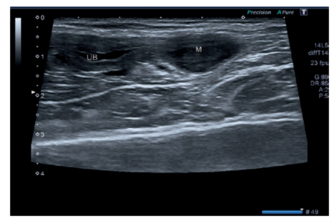
Figure 2. Sagittal ultrasound image showing the urethral hypoechoic mass (M) and an empty urinary bladder (UB) cranially.

Abdominocentesis was performed and the analysis of the abdominal fluid confirmed the presence of a uroabomen (fluid creatinine 1662 \mu mol/l in comparison with plasma creatinine of 858 \mu mol/l). Cytological examination of the abdominal fluid showed a high number of erythrocytes and abundant neutrophils; however, no lymphoid cells were identified.