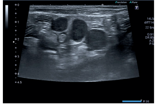
Figure 4. US image showing enlarged, rounded and hypoechoic mesenteric lymph nodes.

Ultrasound-guided aspirate biopsies of the abnormal lesions were taken under sedation. These included the urethral mass, kidney nodules and lymph nodes. The cecal wall lesion was not sampled due to its position. Cytology of all the organs sampled was