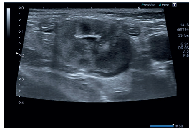
Figure 3. Sagittal plane of the left kidney showing irregular margin, loss of the cortico- medullary differentiation and the presence of multiple hypoechoic cortical nodules.